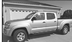
Toyota Tacoma 51,000 miles