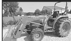
Kubota L3830 290 hrs.