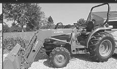
Kubota L3830 1196 hrs.