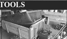
DR Power Wagon