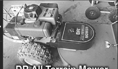
DR All Terrain Mower

Announcements made day of sale supersede all printed material. TERMS: CASH, PERSONAL CHECKS WITH PROPER I.D., BUSINESS CHECKS WITH BANK LETTER AND NO OUT OF STATE CHECKS UNLESS APPROVED BY SELLER. Email Us At kkauction@sbcglobal.net . Everything sells as is with no guarantees. Not responsible for accidents.