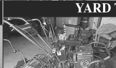
Troy-Bilt Horse Tiller