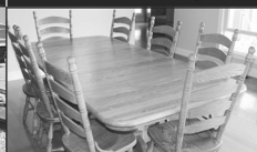
Amish Oak Dining Table