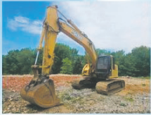
John Deere 225C LC