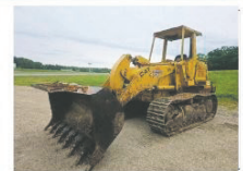
1987 Caterpillar 953A Track Loader