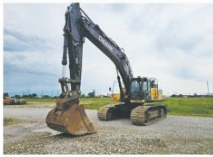
John Deere 450G LC