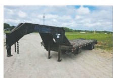
2000 Diamond C 28' Gooseneck Trailer