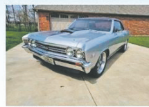
1967 Chevrolet Chevelle