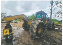
John Deere 648 G3 Grapple Skidder