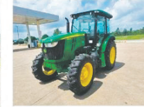
2017 John Deere 5100E