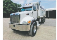
2007 Peterbilt 340 Dump Truck