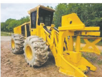
TTigercat 718 Feller Buncher