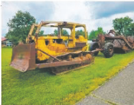
Caterpillar D7 Crawler Dozer with Garwood Scraper