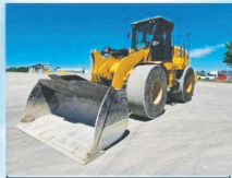
Caterpillar 950 Wheel Loader