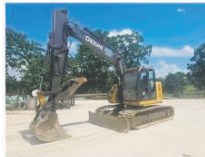
John Deere 135G