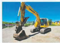
Komatsu PC 228US LC