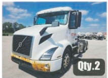
2018 Volvo VNR64T Day Cab