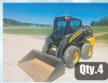
2015 New Holland L228