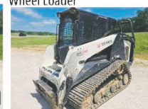
2013 Terex PT-110 Forestry