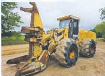
John Deere 643H Feller Buncher