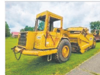
Caterpillar 613B Scraper