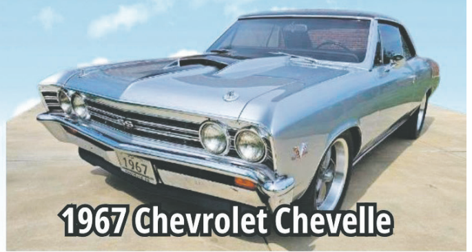
1967 Chevrolet Chevelle