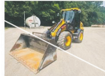
JCB 409 T4