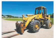
1985 Caterpillar 926 Wheel Loader