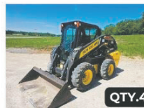
2015 New Holland L228