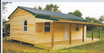
Shown with Available Options

2x6—16" on center-Exterior Stud Walls Residential Roof Trusses-2' on center 4/12 pitch with 1' over hang 40 year Painted Metal roofing in 20 Different Colors Profile Ridge Vent - Ventilated Ridge Cap Vinyl Center Vent Soffit Color Matched Metal Fascia & Gable Trim 2 - 3' 6 Panel Entry Doors 4 - 3'x4' Vinyl Insulated Windows