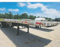
2007 Mana 48' Flatbed trailer