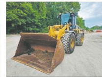
caterpillar 938G Series II Wheel Loader