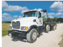
2006 Mack Roll Off Truck