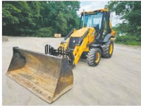
JCB 3CX Backhoe