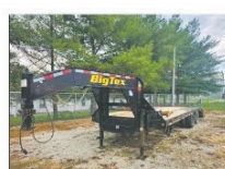
2021 Big Tex Gooseneck Trailer