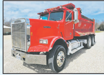
1988 Freightliner Dump Truck