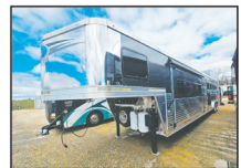
2014 Lakota Charger Horse Trailer