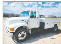
2000 International 4700