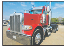
2016 Peterbilt 389