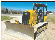
2018 Caterpillar D4K2 XL Dozer