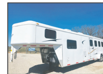
2010 4-Horse Bison Trail Express Trailer