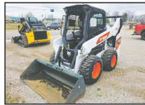
2022 Bobcat S66 Skid Steer JUST 38 HOURS!