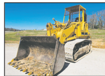
1998 Caterpillar 963B Crawler Loader