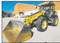
2014 JCB T4i III TM320 Telescopic Wheel Loader