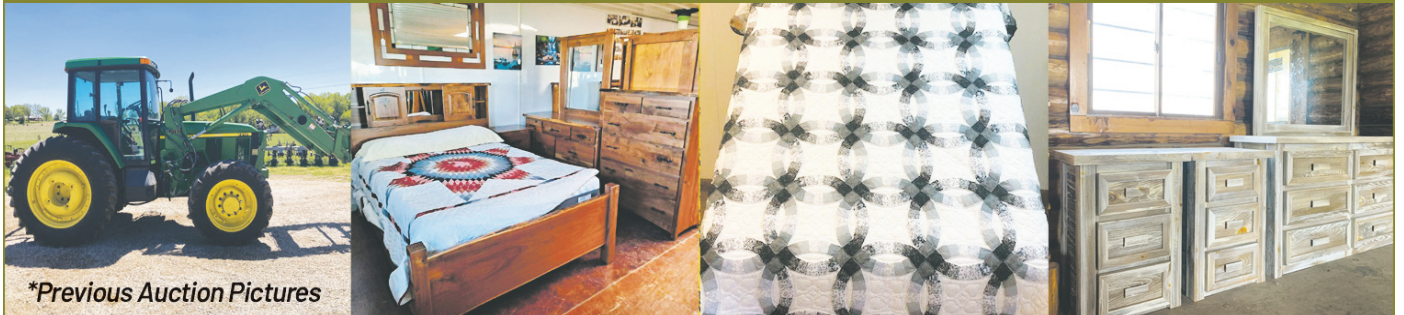
*Previous Auction Pictures