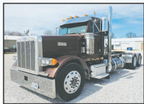
1997 Peterbilt 378 Day Cab