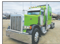
2007 Peterbilt 379