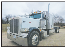
2013 Peterbilt 389