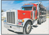
1998 Peterbilt 379 Dump Truck