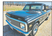
1971 Chevrolet C10 Cheyenne