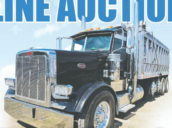
2006 Peterbilt 335 Tri-Axle Dump Truck