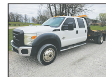
2011 Ford F-550 SELLING TO THE HIGHEST BIDDER!