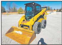
2019 Caterpillar 262D3 Skid Steer