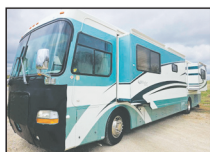
2000 Monaco Motorhome RV