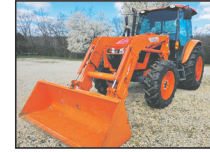
2016 Kubota M5-11 Tractor