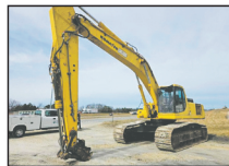
1999 Komatsu PC400LC Excavator