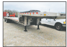
2021 Reitnauer Trailers Big Bubba Drop Deck