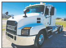
2020 Mack Anthem