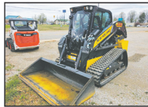
2022 New Holland C332 Skid Steer JUST 44 HOURS!