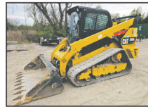
2018 Caterpillar 299D2 Skid Steer