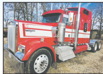
1998 Kenworth W900L