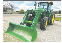
2021 John Deere 6120E