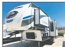
2019 Forest River Artic Wolf Cherokee Limited Camper