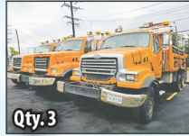
Qty. 3 2005-08 Sterling Dump Trucks