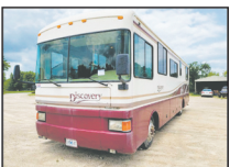
1999 Fleetwood Discovery