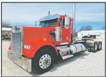
1996 Kenworth W900 Day Cab