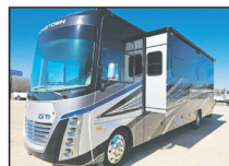
2021 Forest River Georgetown RV