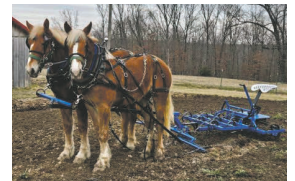
2 yr old registered mares

Already consigned is a large selection of new and used farm machinery Used: 6 rebuilt #9 trailer gear mowers with dolly wheel and raised tongue, 6ft Heim press brake, Work Saver post pounder, 2-56 New Holland rakes rebuilt, 2 gravity wagons, JD hay wagon, IH corn binder, Fairbanks-Morse weight scale 8ft wide 24ft long, 2 silky plows, Rebuilt New Idea 10A spreader, 13 hole double disc JD drill, Adams road grader, 1 row potato planter, New Idea hay loader only used 1 time, JD 300 fertilizer spreader New: 715 WH plows, Cultimulchers sized 3ft, 4ft, 6ft, and 8ft; 18 EHC tedder, 22ft EHC tedder, Garden cultivators, Yokes and eveners, Corral panels, Forecarts