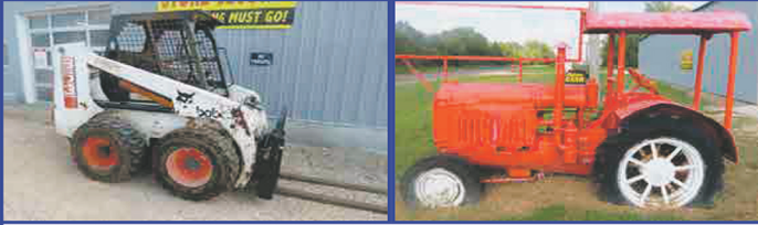
Bobcat 853 rubber tired diesel skidsteer-72" bucket-Bobcat 48" pallet forks, McCormick Deering 15-30 tractor with canopy, 3 rims and tires for Bobcat skidsteer, pallet jacks