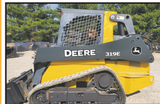
2015 Deere 319E 69hp, 1874hr, Joystx, NEW Trax.....$34,900