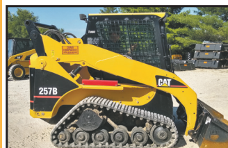
2006 Cat 257B **ONLY 399HR** 62hp AC/ Cab Joystx.....$49,900