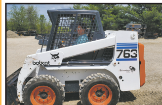
2000 Bobcat 763 *LIKE NEW* 106 HOURS, Clean & NEW Tires* .....$34,900