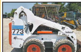
2001 Bobcat 773 *1 OWNER* HiFlow* 46HP 734hrs OROPS, NEW TIRES..$27,500