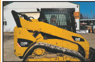
2011 Cat 259B3 75hp AC/Cab Joystx 2sp NICE.....$34,900