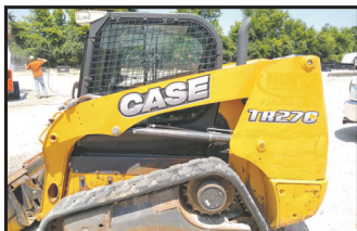
2014 Case TR270 74hp 2163hr Cab/AC Joystx 2speed, Pwr Bkt Chngr.....$39,900