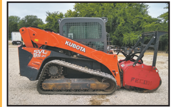
$79,900 2018 Kubota SVL95-2 & Fecon Mulching Head HiFlow, Loaded!