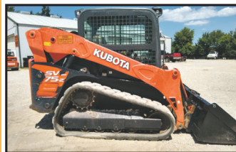
2018 Kubota SVL75 *1 owner* 74hp, 1768hrs, AC/Cab, Joystx, PwrBkt Chngr.....$48,900