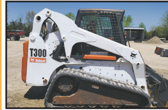
2006 Bobcat T300 81hp 2992hrs AC/Cab ISO/H Joystx A+Trax.....$42,500