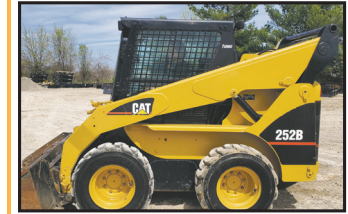
2006 Cat 252B 73hp 3566hrs AC/Cab Joystx, PwrBkt Chngr.....$29,900