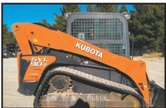
2015 Kubota SVL90 92hp, 2943hrs, AC/ Cab, Joystx, 2sp, Pwr Bkt Chngr.....$42,500