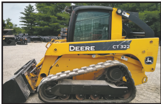
2007 Deere CT322 66hp, 1233 hrs, AC/ Cab, foot controls .....$32,500