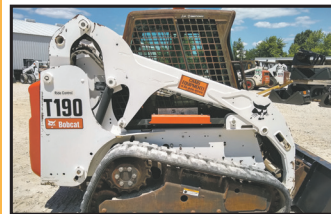
2009 Bobcat T190 *HiFlow* *ONLY 627hr* AC/Cab Joystx.....$49,900