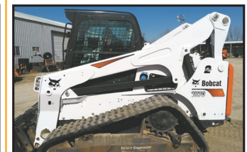
2021 Bobcat T870 *HiFlow* 540hrs, AC/Cab, Joystx, Warranty!* .....$84,900