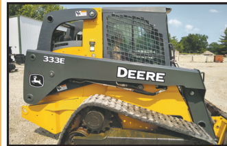
2017 Deere 333E * 100hp 3529hrs AC/Cab Joystx 2sp .....$44,900