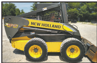
2007 New Holland L185 82hp 2688hrs OROPS, Foot Controls & Foam Filled Tires .....$22,500