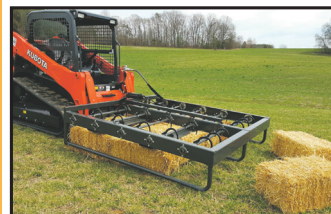
Bale Accumulator Grapple.....$4,825