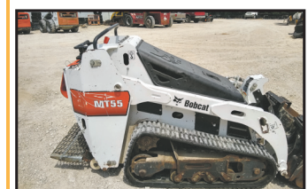
2018 Bobcat MT55 25hp 906hrs Ride-on Approx. 36" wide.....$18,900