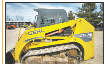
2010 Gehl CTL75 83hp, 1435hrs, AC/Cab, Joystx, 2sp.....$42,500