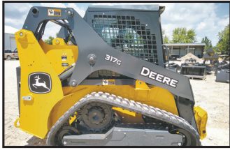
Starting at $55,995 2022 Deere 317G *UNUSED* Cab&OROPS, Loaded! IN-STOCK