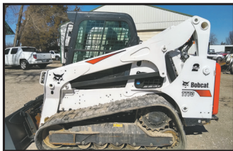
2021 Bobcat T770 *HiFlow* 733hr AC/Cab Joystx *Warranty* .....$72,500