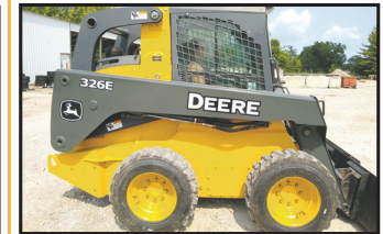
2016 Deere 326E *HiFlow* 2300hr AC Joystx 2speed NEW Tires.....$39,900