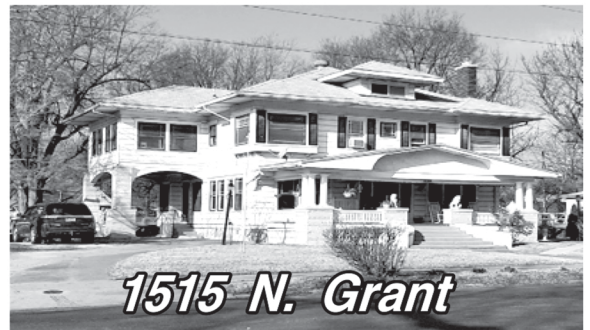
1515 N. Grant