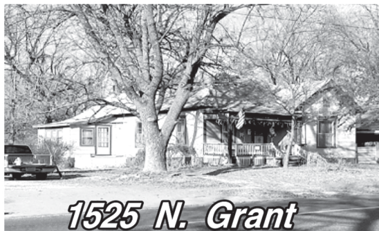
1525 N. Grant