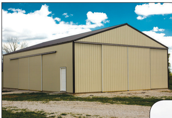
Custom Homes • Metal Roofs