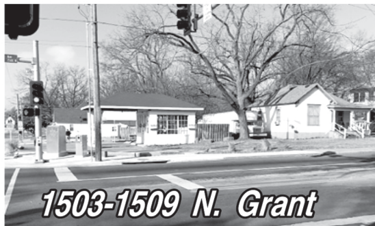
1503-1509 N. Grant