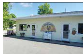
Littlefork-$395,000 Well cared for café, motel and RV park situated on Main St. MLS#139606 & 6090797