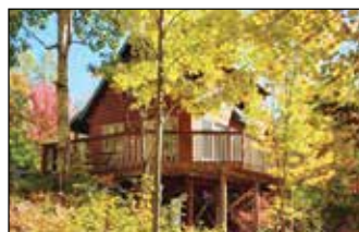
Orr-$195,900 Partially furnished 2 BR cabin near Ash Lake sleeps 8 plus a guest cabin, also sleeps 8. A great up north getaway! MLS#142410 & 6099886