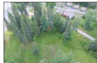
Orr-$69,900 Ash River lot #10 in Bear Ridge on Ash River CIC. Has electric, shared septic/water, 155 ft of shared shoreline, a dock slip and gazebo. MLS#140033 & 6092213