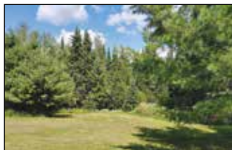
Orr-$69,900 Ash River Lot #5 in Bear Ridge on Ash River CIC. Has electric, shared septic and water, 155 ft of shared shoreline. MLS#140956 & 6095462