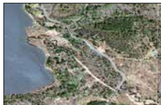
Pickerel Lake, Effie-$69,900 4.13 acres with 422 ft of shoreline on Pickerel Lake near Deer Lake. MLS#141001 & 6095647