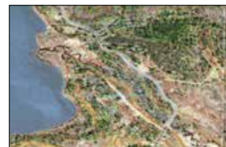
Pickerel Lake, Effie-$79,000 3.28 acre waterfront lot with approx. 206 ft shoreline near Deer Lake. MLS#141036 & 6095762