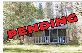
Orr-$36,900 Hunters delight! Rustic-cabin with gas lights on 2.75 wooded acres bordering public lands and near Pelican Lake. MLS#142492 & 6100250

Visit our website to view virtual tours on most residential properties