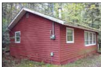
Pelican Lake, Orr-$179,900 Cabin, sauna, dry boathouse, with 226 ft of shoreline. Electric to main cabin and sauna. Needs some TLC. MLS#142280 & 6099533