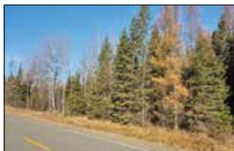
Orr-$69,900 Ash River lot #4 in Bear Ridge on Ash River CIC. Has electric, shared septic/water, 155 ft of shared shoreline, a dock slip and gazebo. MLS#140026 & 6092208