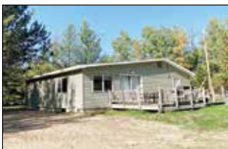
Orr-$99,999 Up north hunting getaway! 2 BR cabin with drilled well and newly installed septic on 34 wooded acres bordering state lands. MLS#142426 & 6099979