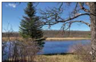
Orr-$79,900 8 wooded acres on the Vermilion River with 324 ft of shoreline. Public lands nearby. MLS#141328 & 6096694