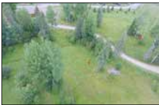
Orr-$69,900 Ash River lot #2 in Bear Ridge on Ash River CIC. Has electric, shared septic/water, 155 ft shared shoreline, a dock slip and gazebo. MLS#140025 & 6092207