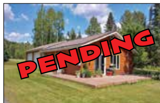
Orr-$235,000 2 BR home in Bear Ridge CIC with a great view of the river and shared amenities. MLS#140055 & 6092311