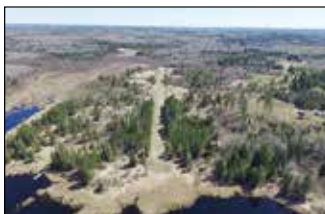
Daniels Pond, Buyck-$225,000 46.5 acres, 1,650 ft airstrip with 3,487 ft of shoreline on a pond. Many lakes and trails near. MLS#141325 & 6096683