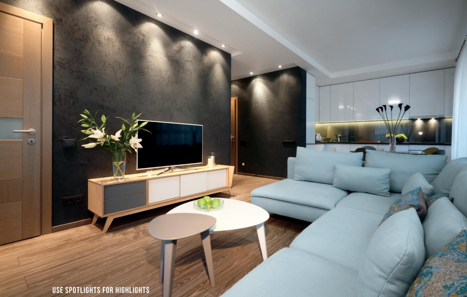
USE SPOTLIGHTS FOR HIGHLIGHTS