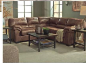
2 PC SECTIONAL

RECLINING SOFA OR RECLINING CONSOLE LOVESEAT MATCHING RECLINER