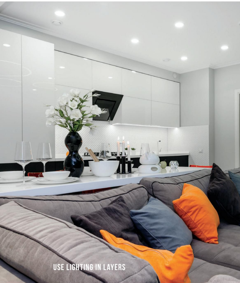
USE LIGHTING IN LAYERS