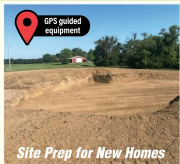
Site Prep for New Homes