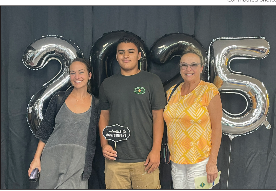
A celebrating Take Stock in Children graduate