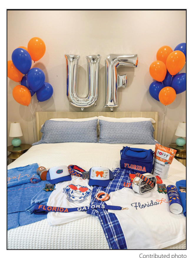
Decorate their space with a bed party.