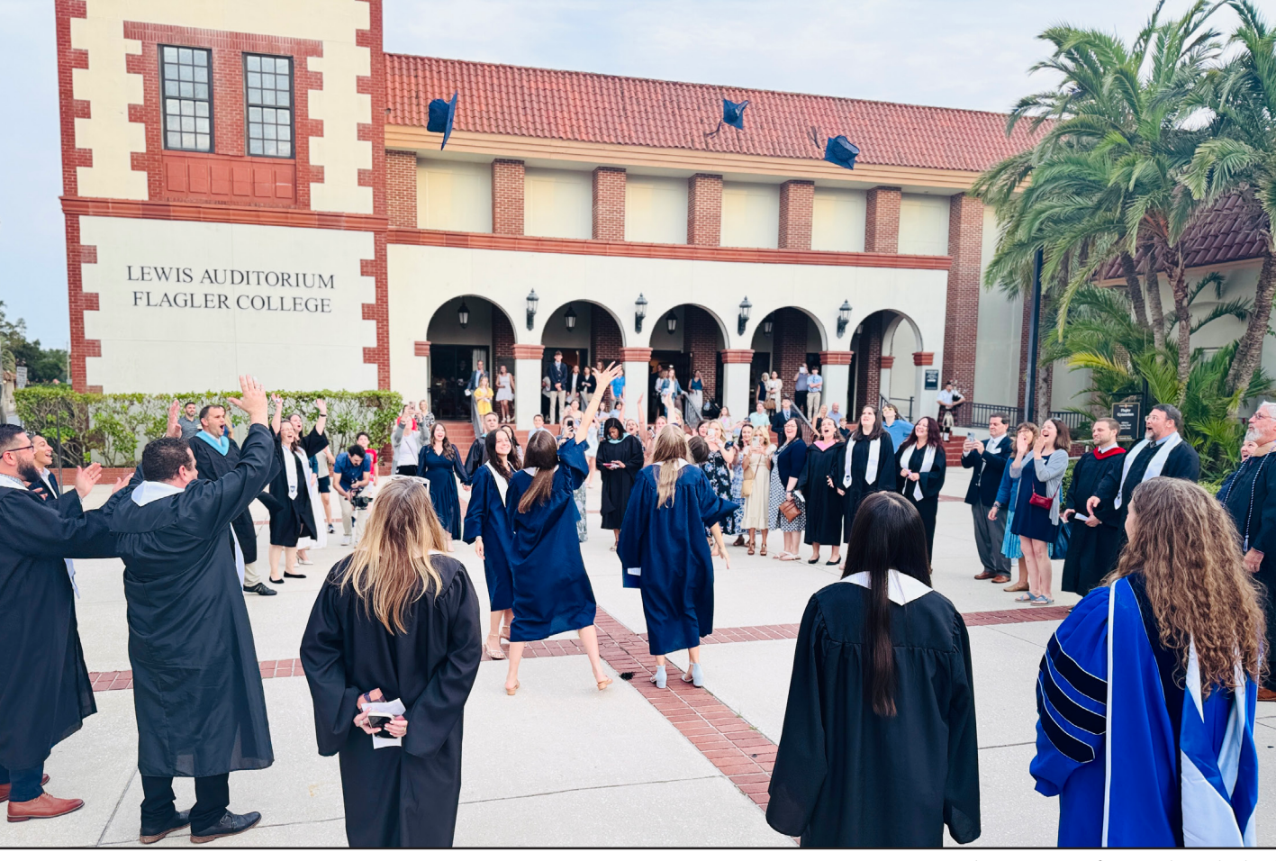
Graduates from Veritas Classical School throw their caps in the air to celebrate.

He came into his role as head of school in 2021 and to see the first graduating class walk across stage after the school was founded eight years ago was a pre-