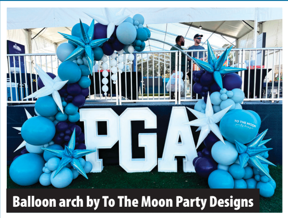
Balloon arch by To The Moon Party Designs