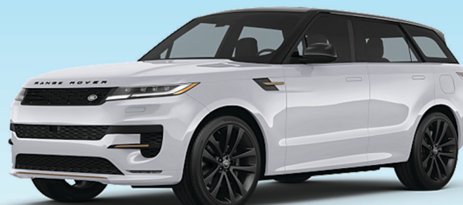
Range Rover Sport

LAND ROVER JACKSONVILLE LANDROVERJACKSONVILLE.COM