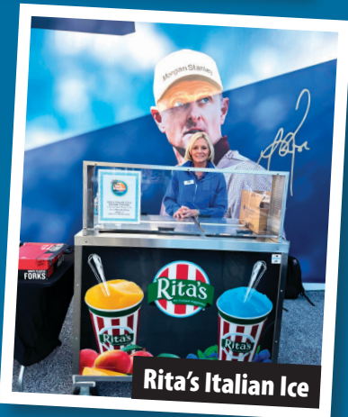
Rita's Italian Ice