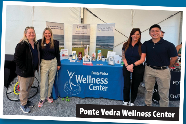
Ponte Vedra Wellness Center