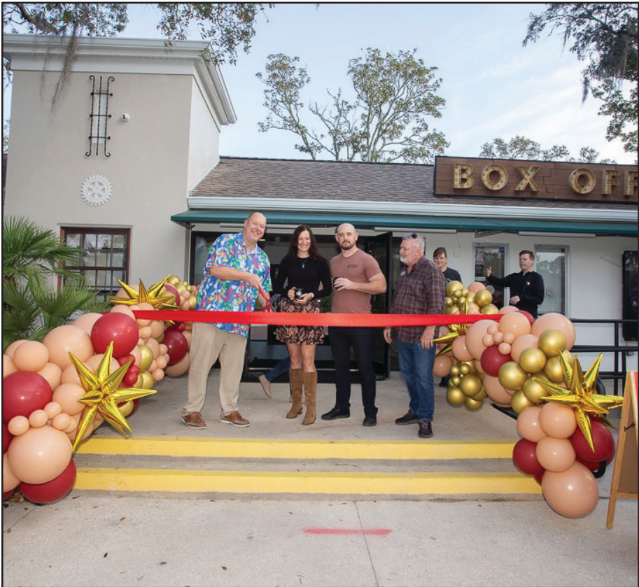
The St. Augustine Amphitheatre recently celebrated the opening of its first onsite merch shop, its renovated box office and The Kookaburra Coffee Outpost.