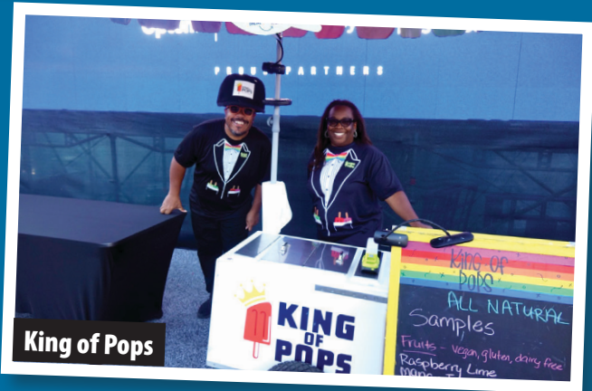
King of Pops