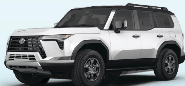
All New Lexus GX

LEXUS OF ORANGE PARK LEXUSOFORANGEPARK.COM