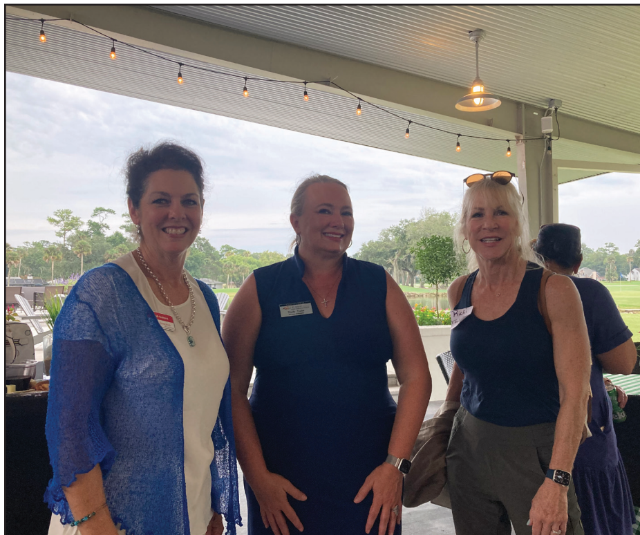
The event was a time to socialize and network.