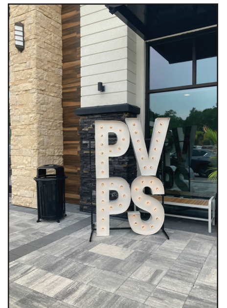
Ponte Vedra Plastic Surgery recently opened its newest location.