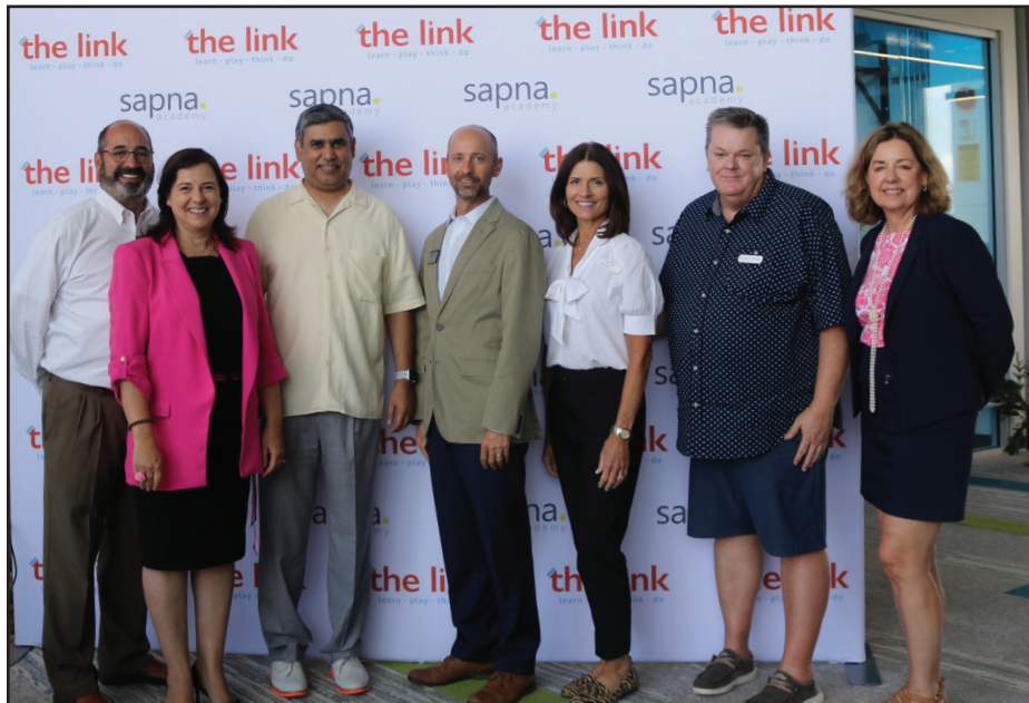
Members of the Chamber and the link took part in a Chamber at Noon event July 14.