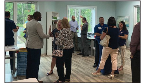
The ceremony also served as an After Hours event for the Chamber.

Coastal Compass Executive Office Suites has been open for about a year and now they are official members of the St. Johns County Chamber of Commerce following a ribbon cutting ceremony July 20. The complex opened in August 2021 and is located at 4210 Valley Ridge Blvd., Suite 101 in Ponte Vedra Beach.