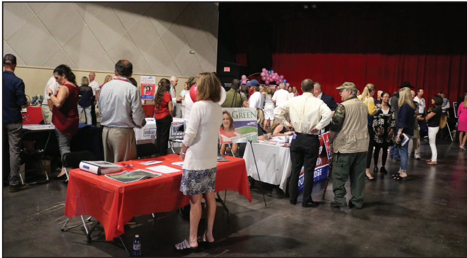
Candidates line the inside of the Ponte Vedra Concert Hall during the Politics St. Johns event July 27.