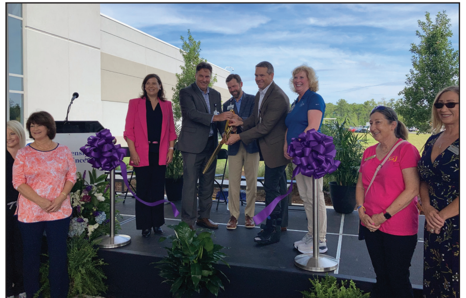
A ribbon cutting and community celebration was held at the site of the new Ascension St. Vincent's Health Center on County Road 210 in St. Johns July 1.