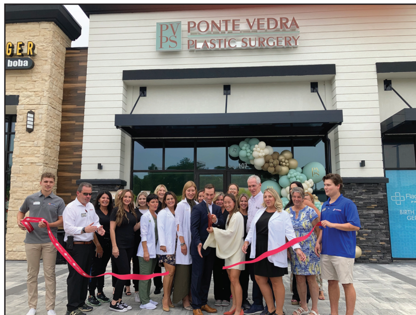
Ponte Vedra plastic surgery cuts the ribbon during the grand opening ceremony of its new location on County Road 210.