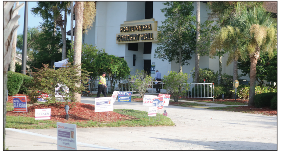
Political signs lined near the entrance of the Ponte Vedra Concert Hall.