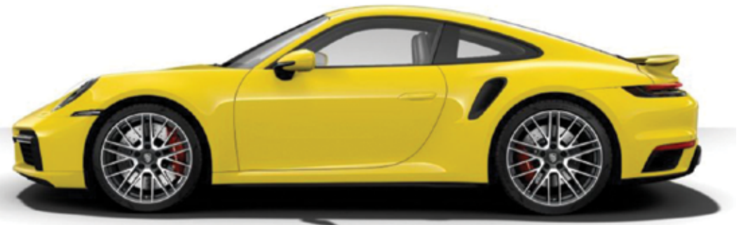
2021 Porsche 911 Turbo in Racing Yellow