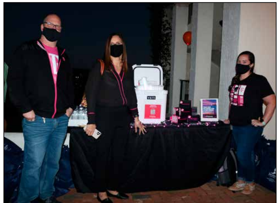
Representatives from Radiance presenting partner T-Mobile participate in the event.