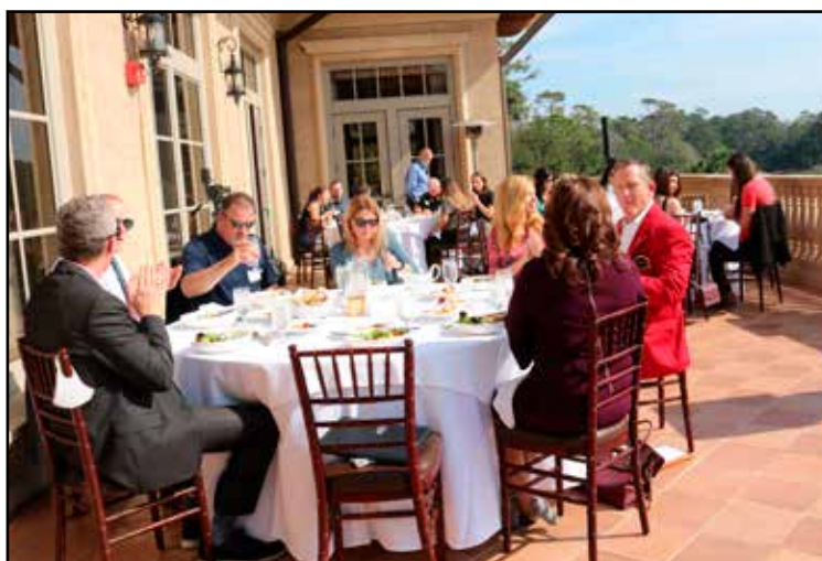
RIGHT: Attendees network and enjoy lunch at the Chamber event.