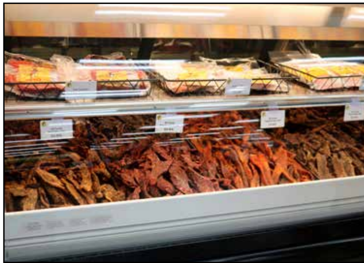
Buc-ee's, located at 200 World Commerce Parkway, boasts a large retail center, as well as numerous snack, meal and drink options.