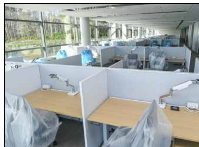
Natural light from large windows brightens workstations at the new PGA TOUR Global Headquarters.