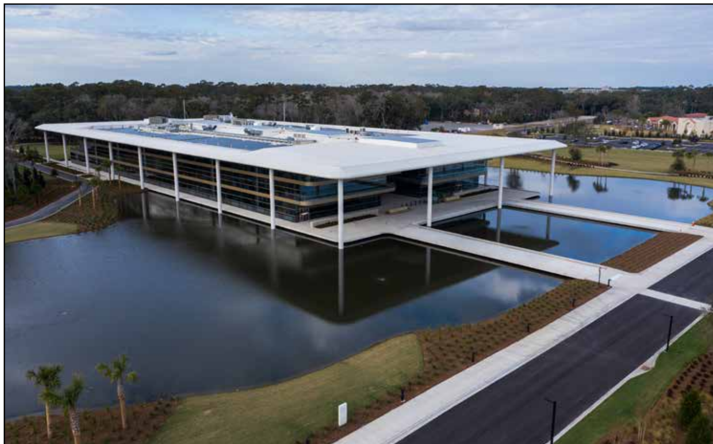
The new 187,000-square-foot PGA TOUR Global Headquarters is surrounded by water in a nod to the iconic 17th hole at TPC Sawgrass.