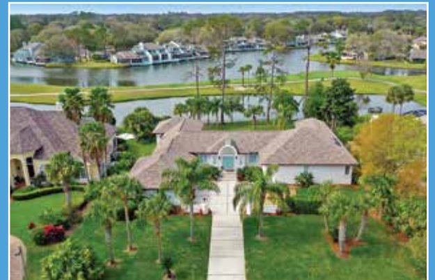
3120 Timberlake Point Sold in 14 Days Sold at $1,125,000