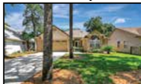
JACKSONVILLE BEACH 3/2 • $450,000 Susan Fort or Tyler Ackland