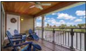
THE POINTE 3/2 • $599,000 Suzanne Schinsing

View Our Listings at www.pvclubrealty.com