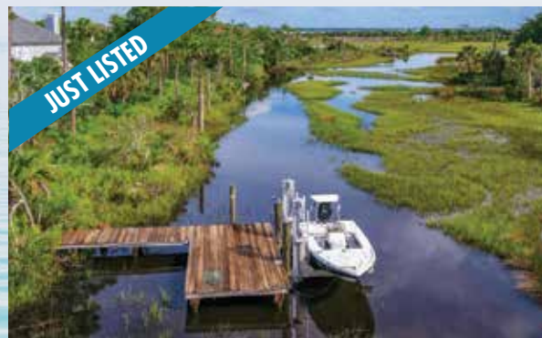
Coastal traditional home at Royal Tern Court is listed for $1,199,000