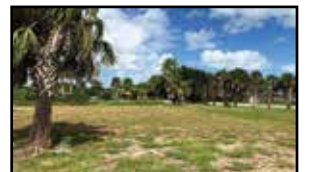
PONTE VEDRA BLVD Homesite • $800,000 Pam Henry