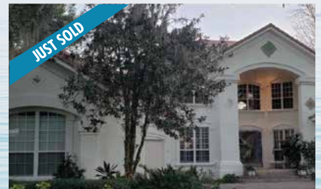
Waterfront estate in Queens harbour on the basin to the intracoastal with golf views