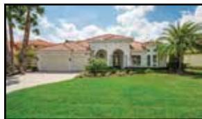
MONTURA 4/3/1 • $1,049,000 Suzanne Stephens