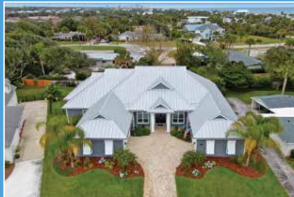
10 Ponte Vedra Circle Sold In One Month Sold at $2,150,000