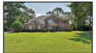
DEERWOOD 5/4 • $749,500 Olivia or Brent Seaman