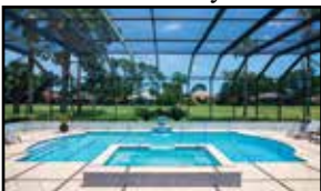
THE PLANTATION 4/3 • $975,000 Mary Faulds | Cindi Blair