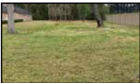
PONTE VEDRA BEACH Homesite • $329,000 Suzie and Rory Connolly