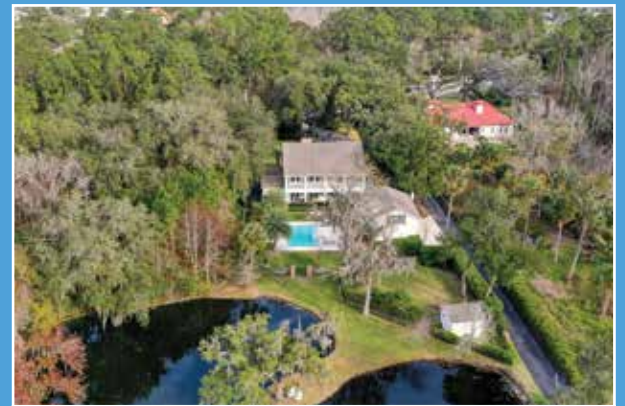
3896 Palm Valley Road Sold The Day It Was Listed Sold at $1,860,000