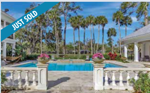
Whisper Lake Lane sold for $1,950,000