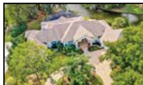
PLAYERS CLUB 5/4/1 • $999,000 Suzanne Stephens