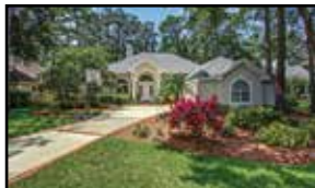
MARSH LANDING CC 4/3 • $679,000 Suzanne Schinsing