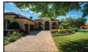
MONTURA 4/4 • $979,000 Patti Armstrong