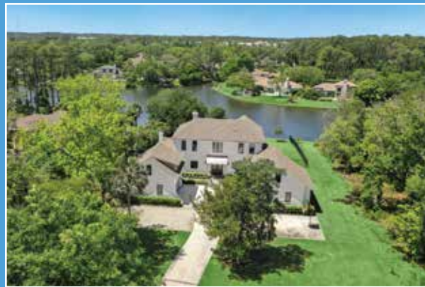
8977 Lake Kathryn Drive Sold in 13 Days & Above List Price Sold at $3,900,000