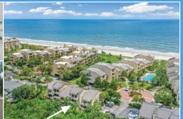
751 Spinnakers Reach Drive 1 Bedroom | 1 Bath | 704 ± SF Offered at $399,000