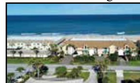
OCEANFRONT 3/3 • $1,200,000 Earl Parker