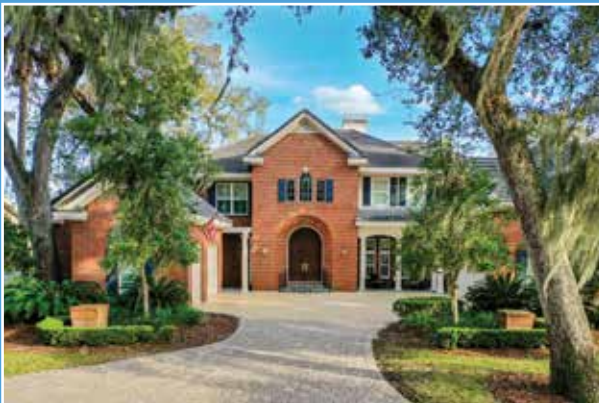
2100 Oak Hammock Drive Cash Sale Sold at $1,160,000