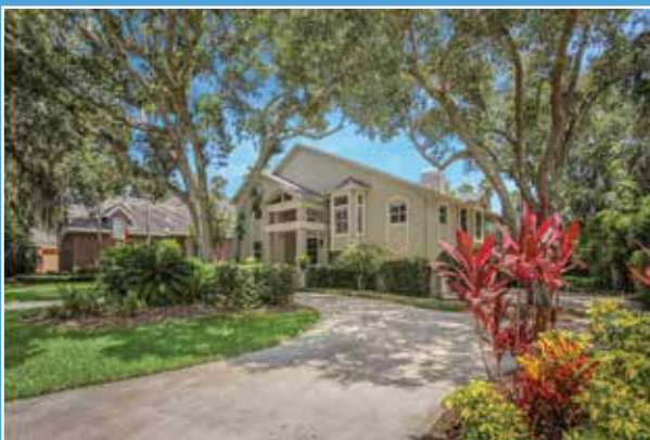
2110 Oak Hammock Drive 4 Bedrooms | 3.5 Baths | 3,110 ± SF Offered at $995,000