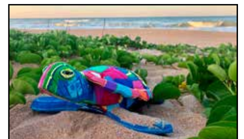
Ocean Soul Africa uses art to raise awareness of the effects of ocean pollution by making colorful art from recycled flip flops.