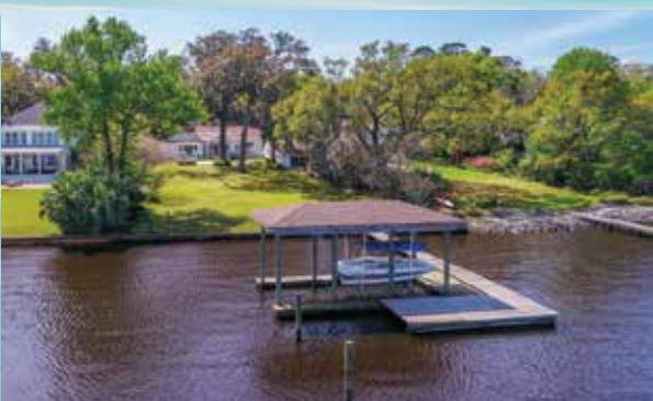
Spectacular Ortega River front home, completely remodeled