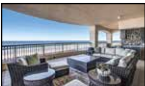
MARBELLA 4/4/1 • $2,600,000 Pam Henry