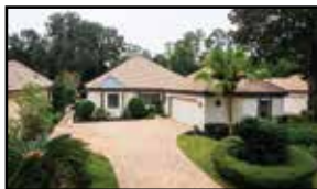
EPPING FOREST 3/2/1 • $865,000 Patti Armstrong