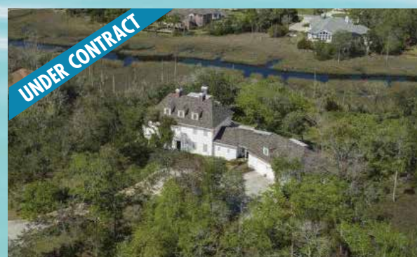
Simply stunning home on the estuary to the Intracoastal in Marsh Landing

Re-Designed to Sell – Luxury, Lifestyle, Real Estate