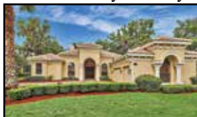
PONTE VEDRA BEACH 4/3 • $899,000 Suzie and Rory Connolly