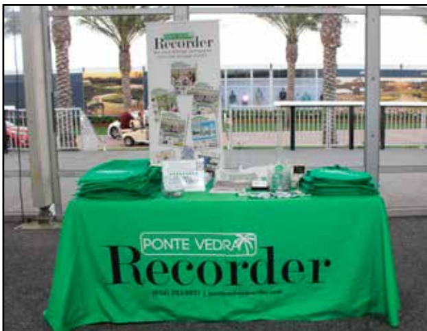
The Ponte Vedra Recorder booth

The Ponte Vedra Recorder was a proud sponsor of the event.