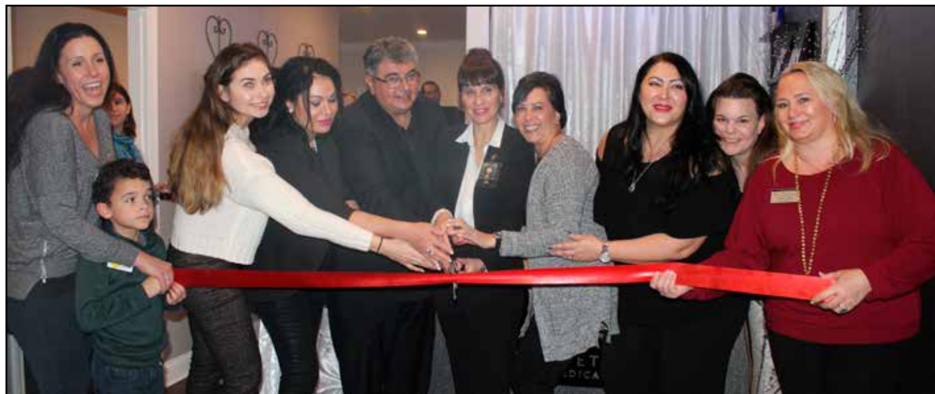
A ribbon-cutting celebration and Chamber After Hours event was held Jan. 29 at Aesthetix Plus Medical Spa.