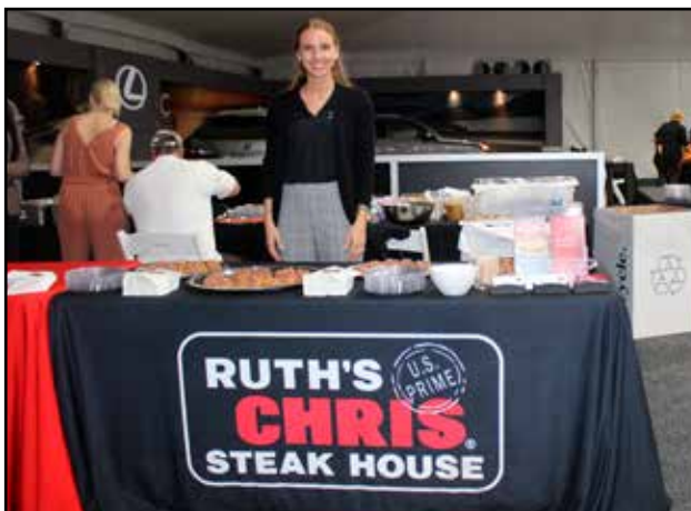
Ruth's Chris Steakhouse booth