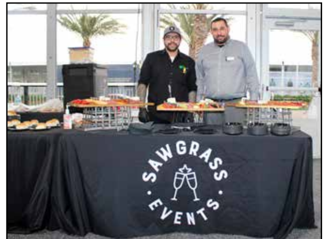
Sawgrass events booth