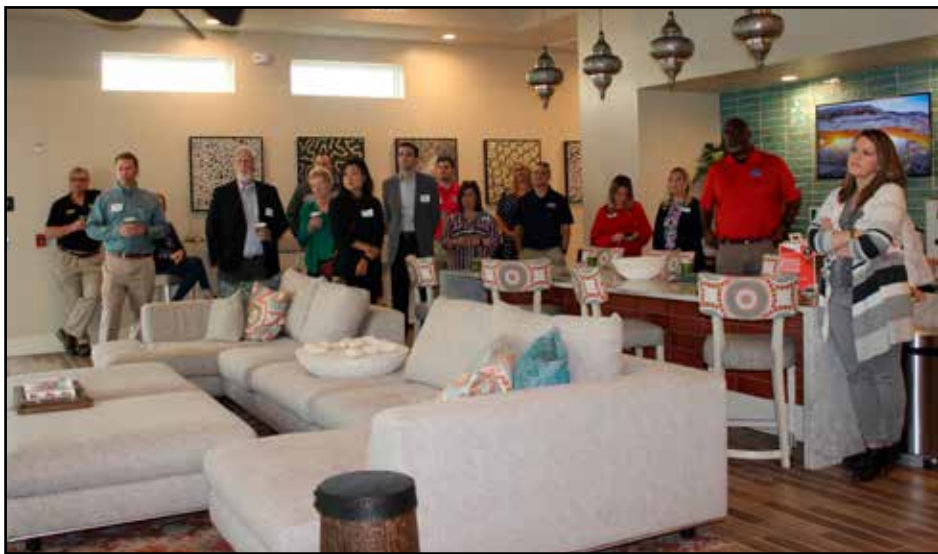
ABOVE: Sentosa Beachwalk holds a Before Hours event for Chamber members to network and enjoy breakfast Feb. 5.