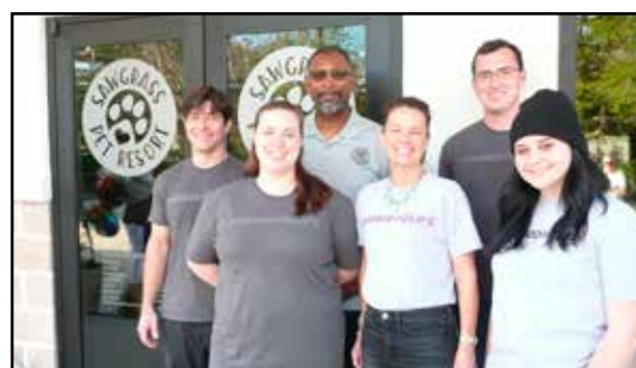
ABOVE: Representatives of Sawgrass Pet Resort and the SJ Chamber Of Commerce, Ponte Vedra Beach Division hold a ribbon-cutting ceremony March 6.