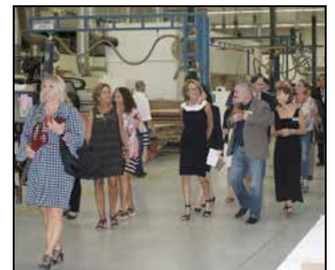
Chamber members tour the firm's 27,000-square-foot expansion at their 2000 Ring Way facility in St. Augustine.

Rulon International, in the business of manufacturing acoustical wood ceiling and wall systems for more than 30 years, launched a new corporate brand identity in the spring. Rulon contributes continued growth and success to an unrelenting commitment to excellence in both product quality and customer service. Since launching in 1985 in Souderton, Pennsylvania, Rulon has gone from working locally in Philadelphia to serving customers worldwide, while also moving the corporate office and manufacturing