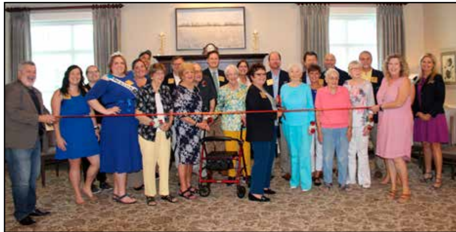
The St. Johns County Chamber of Commerce hosted a ribbon cutting Aug. 24 for the grand opening of the Benton House.

Cook a meal on one of the grills or choose to order from the chef's menu. There are poolside lounges, all with an ocean view. The Beach Club is located at 1111 Ponte Vedra Blvd. in Ponte Vedra Beach.