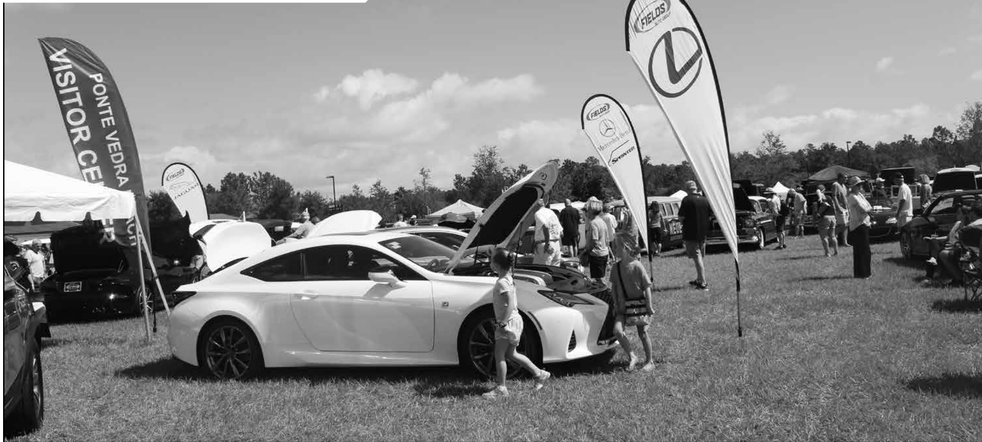
Visitors to the 2019 Ponte Vedra Auto Show check out vehicles on display during the event Sept. 22 at the Nocatee Event Field.