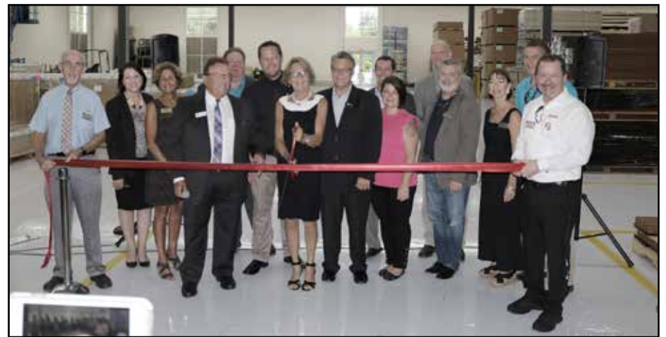
The Aug. 21 ribbon cutting celebrated Rulon International's facility expansion, adding 27,000 square feet to the existing 85,000-square-foot plant.