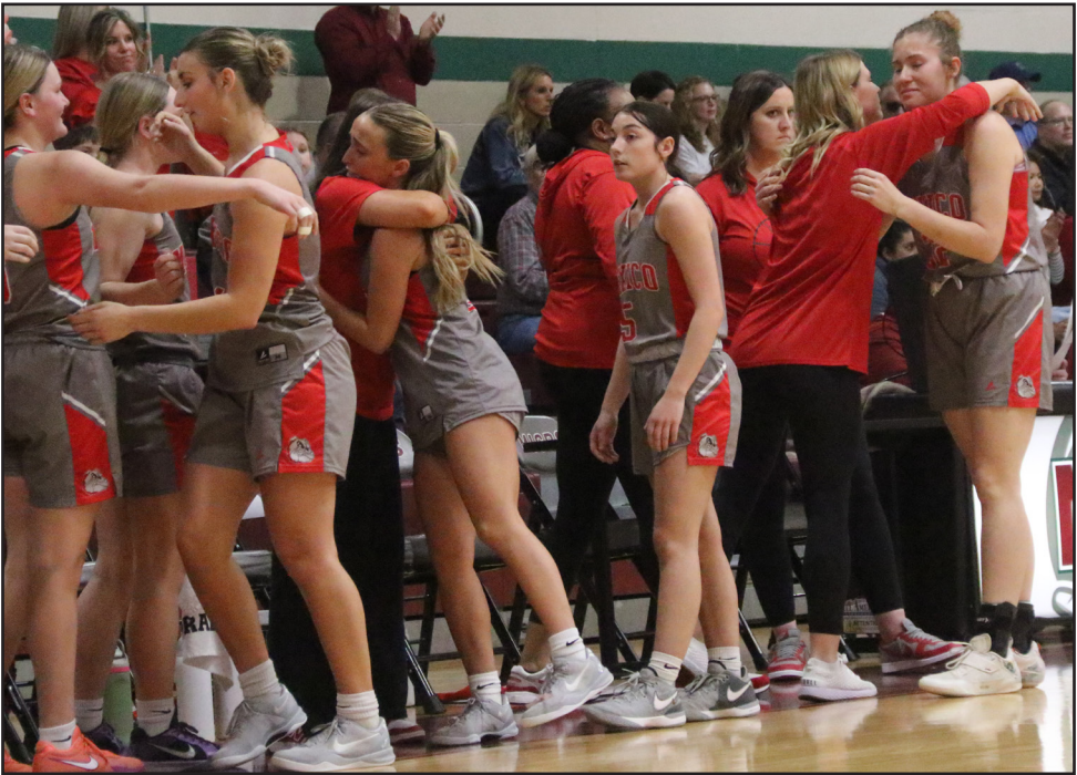
The Mexico girls basketball seniors hug their coaches and teammates after being taken out for the last time during Saturday’s Class 4 quarterfinal game at MICDS in St Louis.