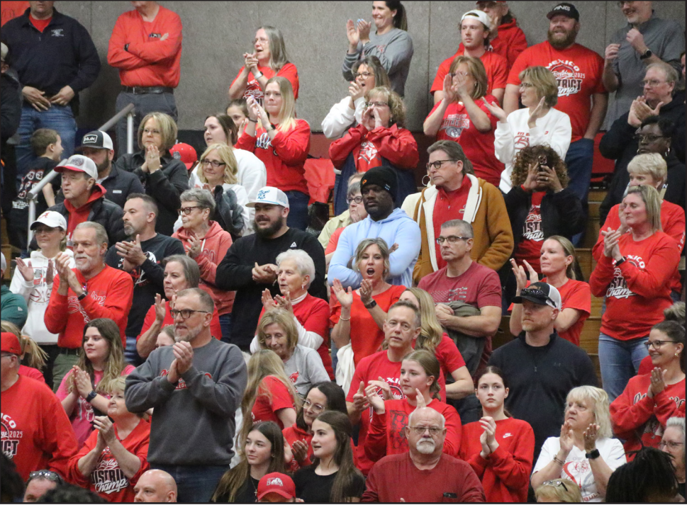
Gary Filbert gym was packed on Saturday night when the Bulldogs hosted a Class 4 boys basketball quarterfinal game against state No. 1 Vashon.