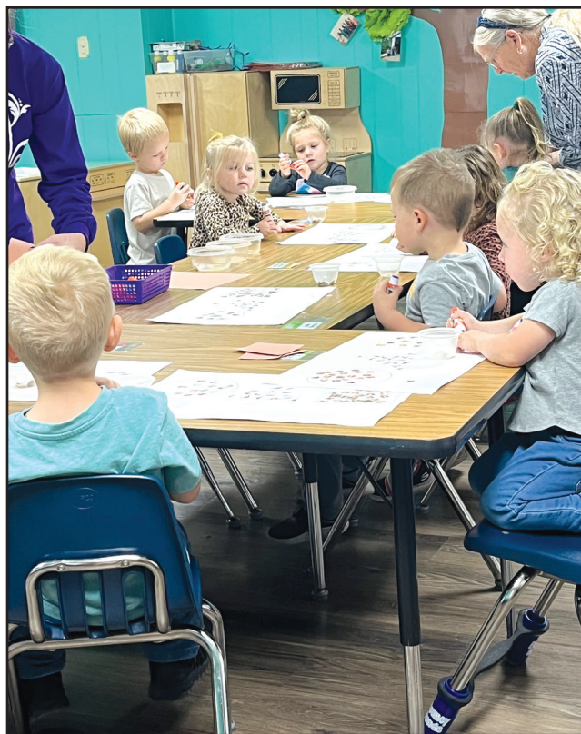
The preschool practices identifying and sorting shapes.