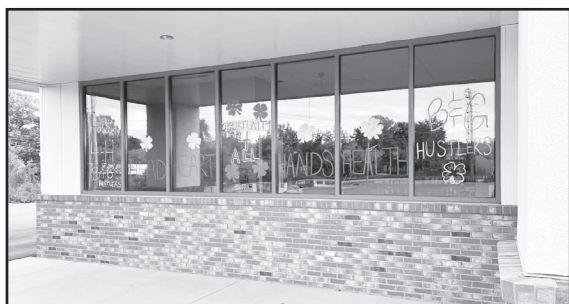
B&G Hustlers 4-H window display at Webber Pharmacy.