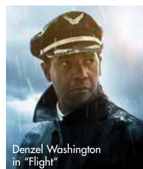
Denzel Washington in “Flight”

Not all such heroes necessarily want to be that widely praised and looked at; even Capt. “Sully” Sullenberger seemed a bit uncomfortable with all the justified praise after his “miracle landing” in New York. But Washington's character, the charismatic and