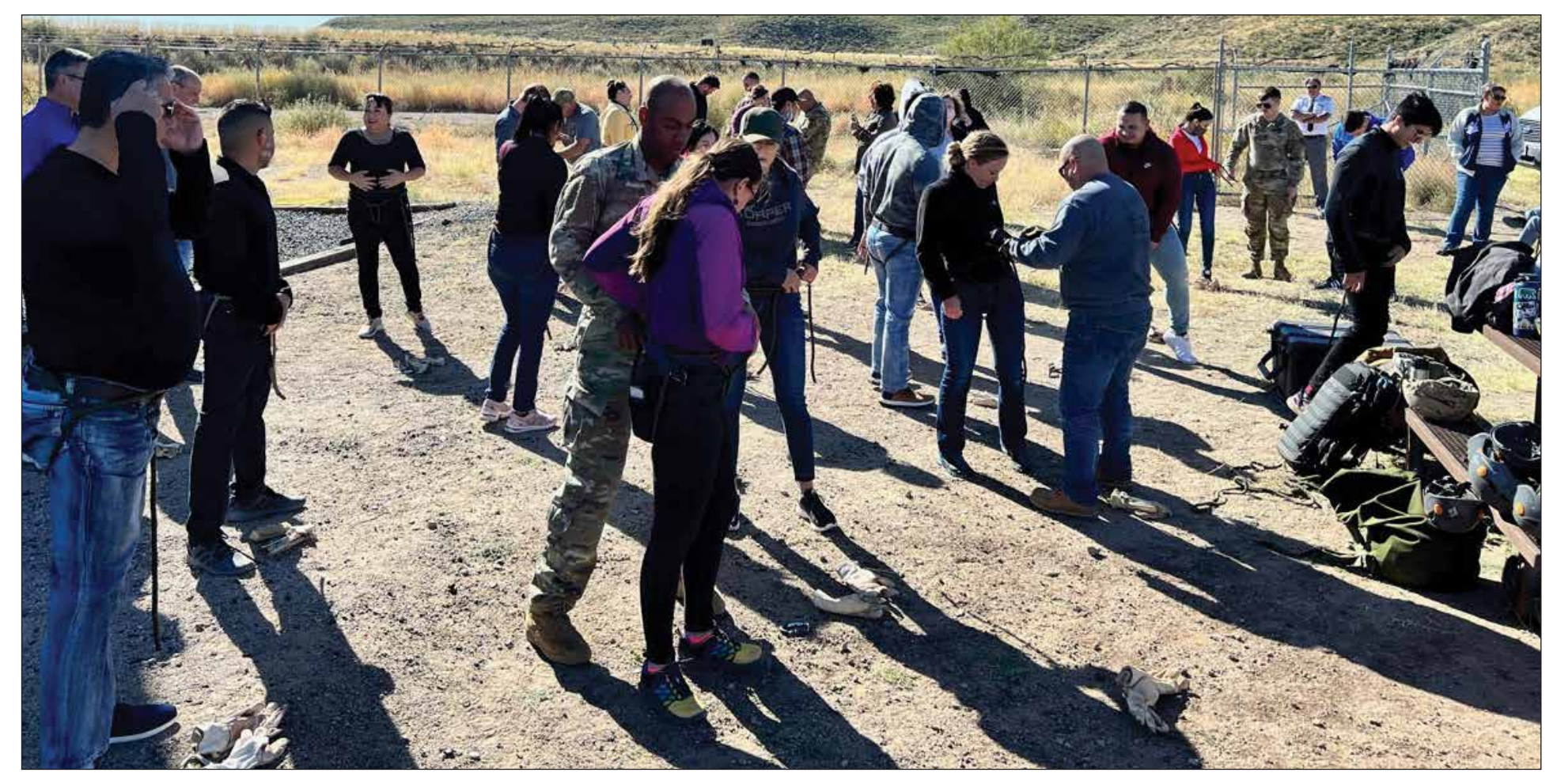
Leadership Las Cruces class members (above and below) participate in rappel.