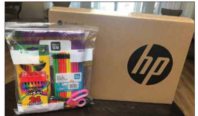
Back-to-school supply drive.