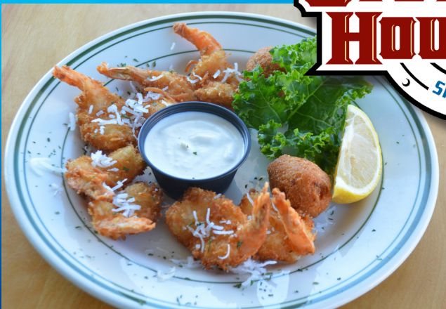
Monday Coconut Shrimp w/Piña Colada Sauce. Choice of two sides. $10.95