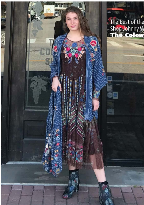
The Best of the Bohemian Look! Shop Johnny Was Collections at The Colony Shop