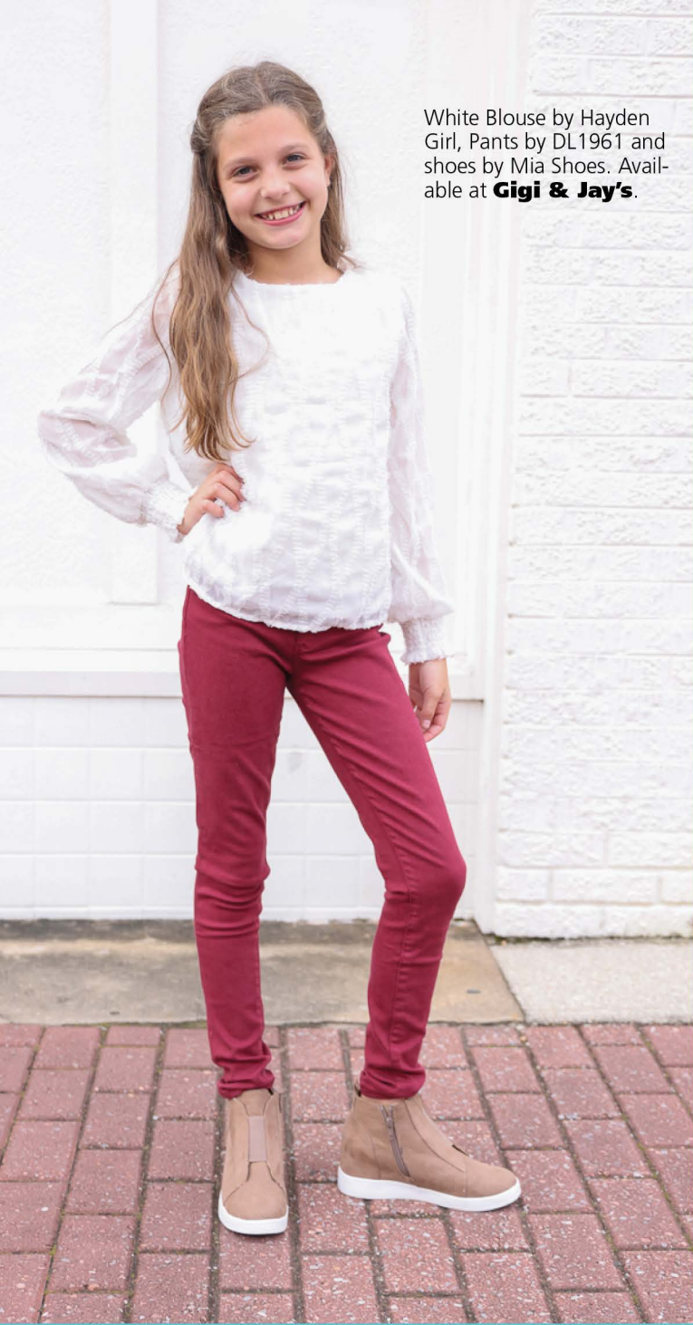
White Blouse by Hayden Girl, Pants by DL1961 and shoes by Mia Shoes. Available at Gigi & Jay's .