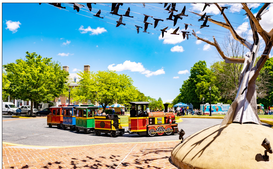
Kids cruise under the birds on a track-less train in the Biggs Museum of American Art parking lot.

The Dover Green has always been a hub of activity, from the colonial and Revolutionary periods through