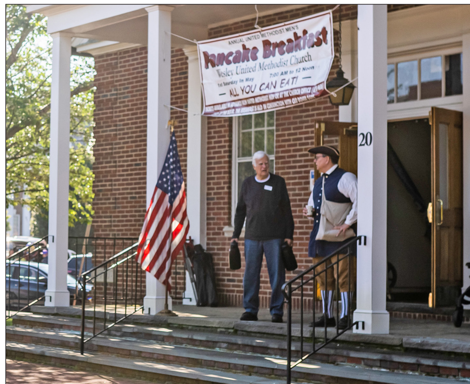
Wesley United Methodist Church offers a pancake breakfast Saturday morning.

Dover Days holds a special place in the hearts of the Friends of Old Dover, since they used to host this event, starting in 1933! On Saturday, May 3, from 10 a.m. to 3 p.m., their exhibits will be available to view at their 323 S. State St location. The museum is open the First Saturday of every month as well as