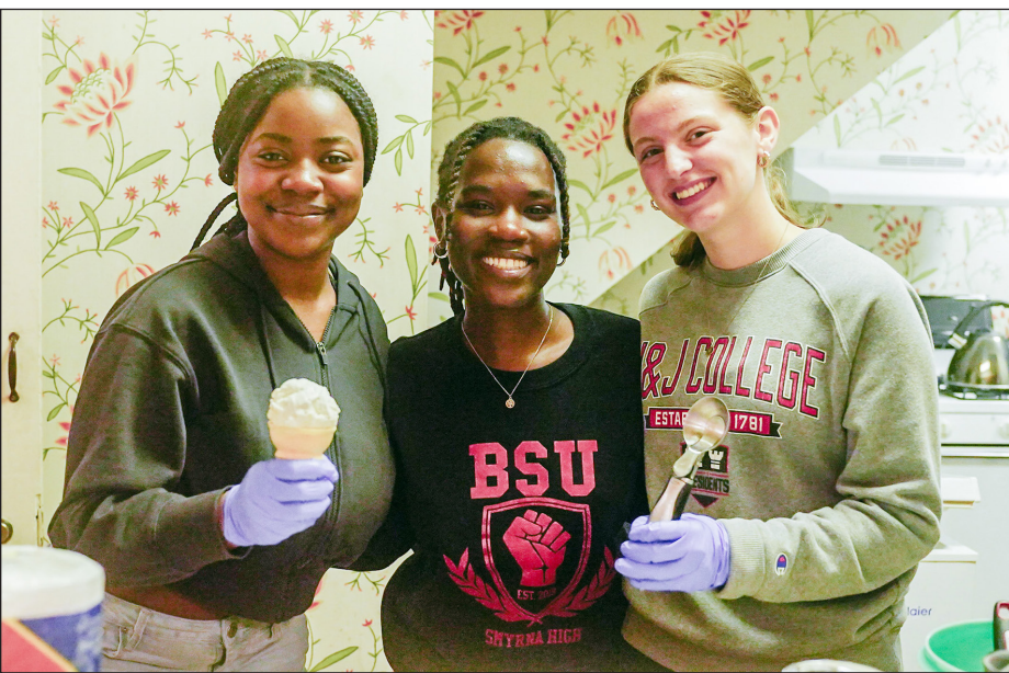
Enjoy a scoop of ice cream in the Victorian parlor at the Dover Century Club.