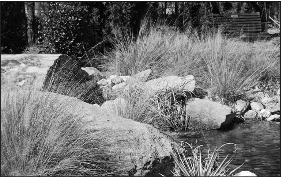
Lawn Renewal and Renovation Tips to Create a Perfect Lawn this Season Gardening expert Melinda Myers shares simple steps for invigorating lawns

The extreme heat and drought of 2012 was hard on lawns and gardens. "Many gardeners are facing a blank slate of bare soil, masses of dead patches that were once lawn or a bit of grass interspersed in a sea of weeds," says gardening expert Melinda Myers. Myers recommends following these steps to improve lawns this season. Start this spring to renovate or improve your weather-worn lawn. Remember that water is critical to get newly seeded and sodded lawns to survive. So be prepared to help nature along with the recovery effort. Evaluate the damage. Then use the check list below to find the best course of action to aid the ailing lawn.