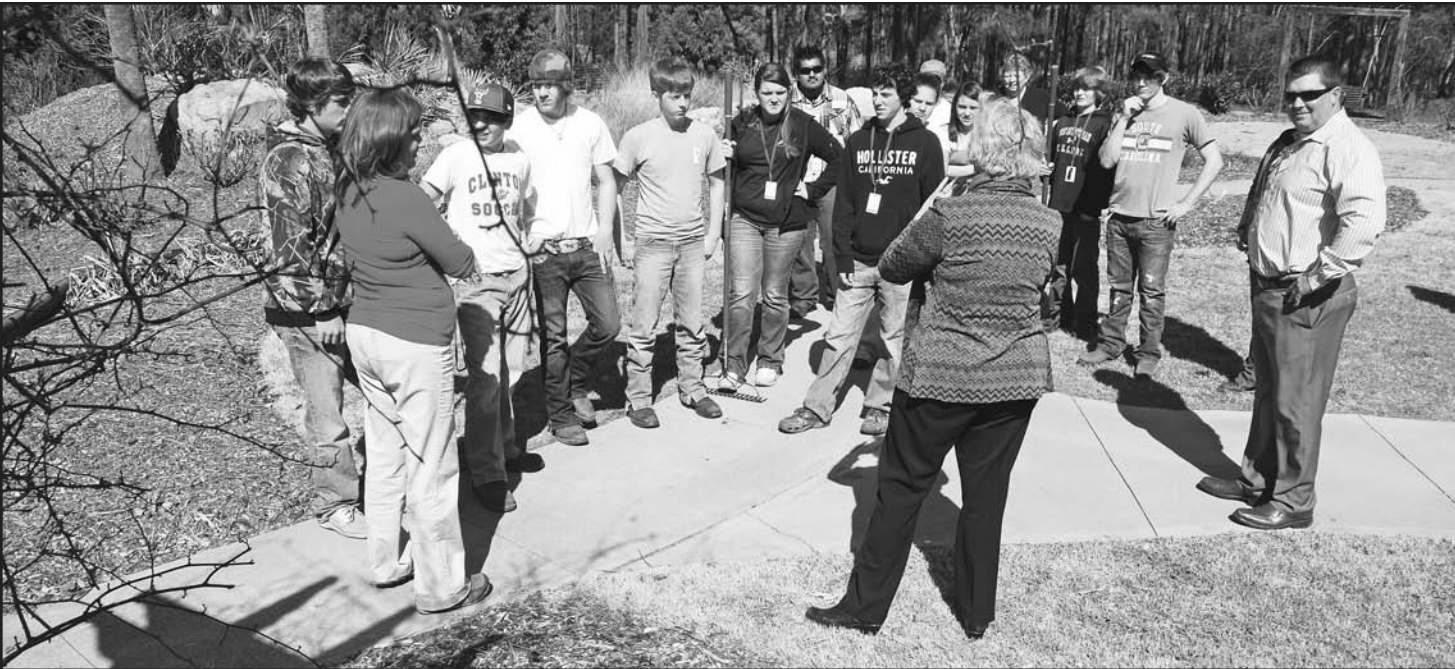
Above: Clinton High School ag class at Hospice of Laurens County. Left: a garden scene at Hospice of Laurens County.