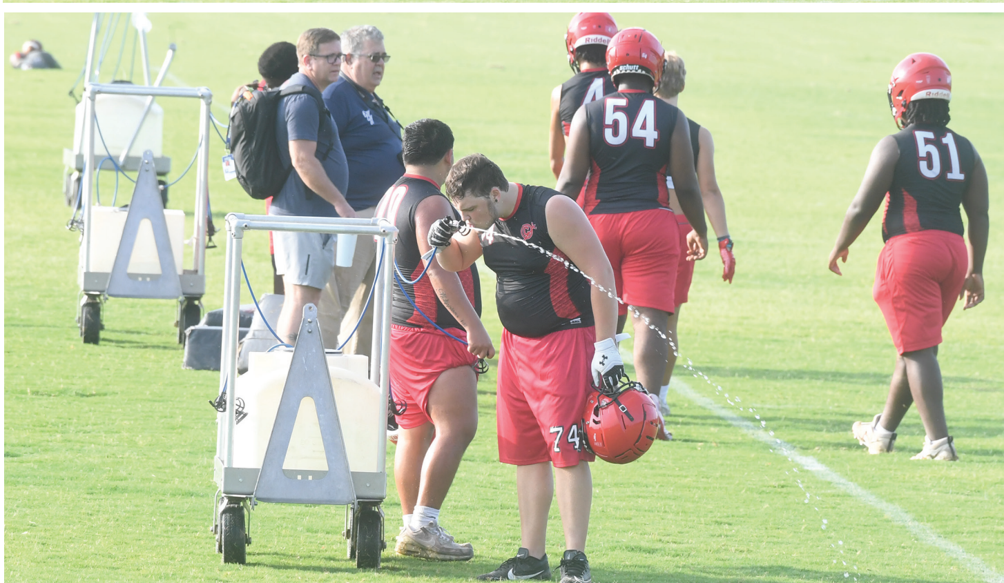
Red Devils' Hydration Station Left -- 8-3