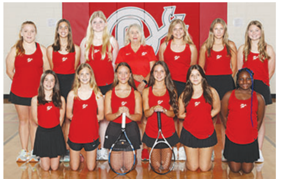
CLINTON HIGH CHEER, COMPETITION CHEER, VOLLEYBALL & TENNIS.