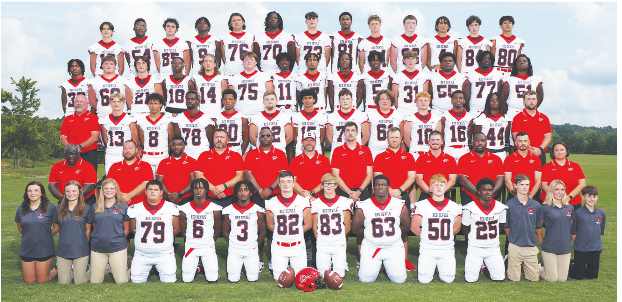
CLINTON HIGH SCHOOL VARSITY FOOTBALL 2024