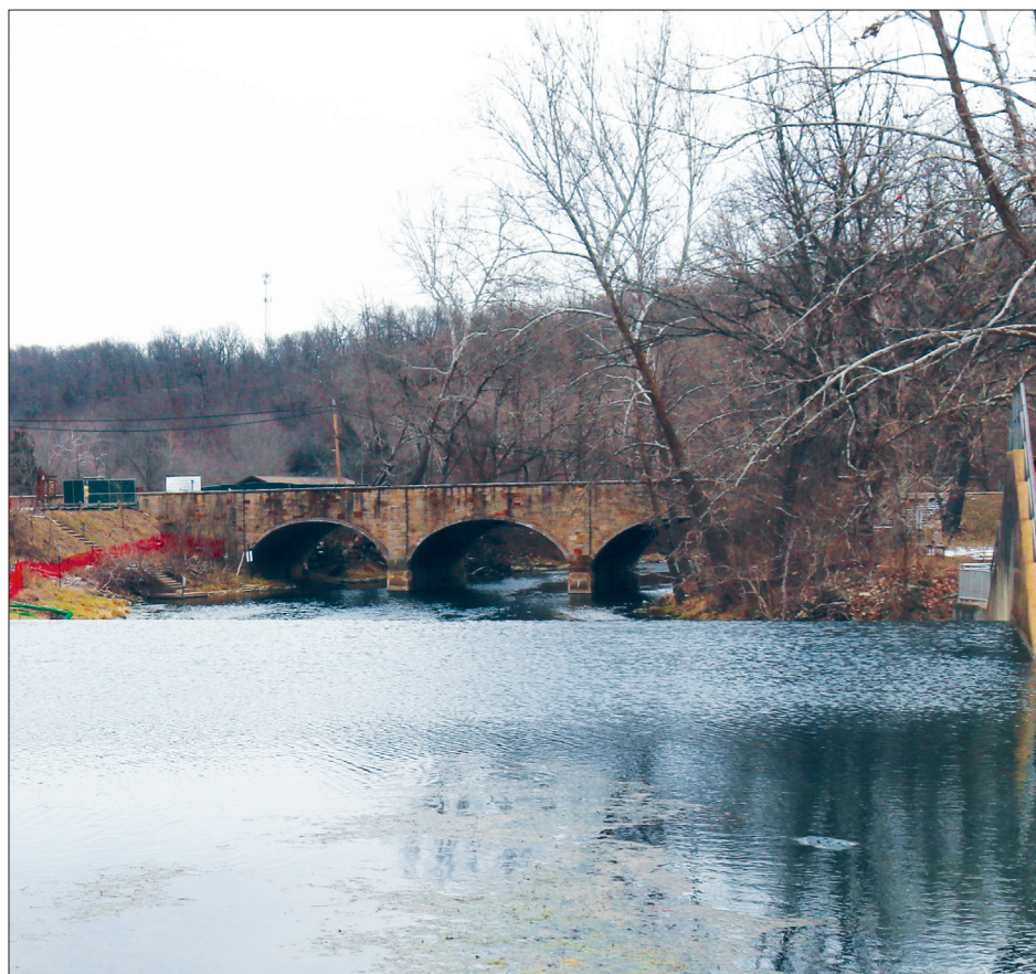
The bridge at Bennett Spring in 2025.