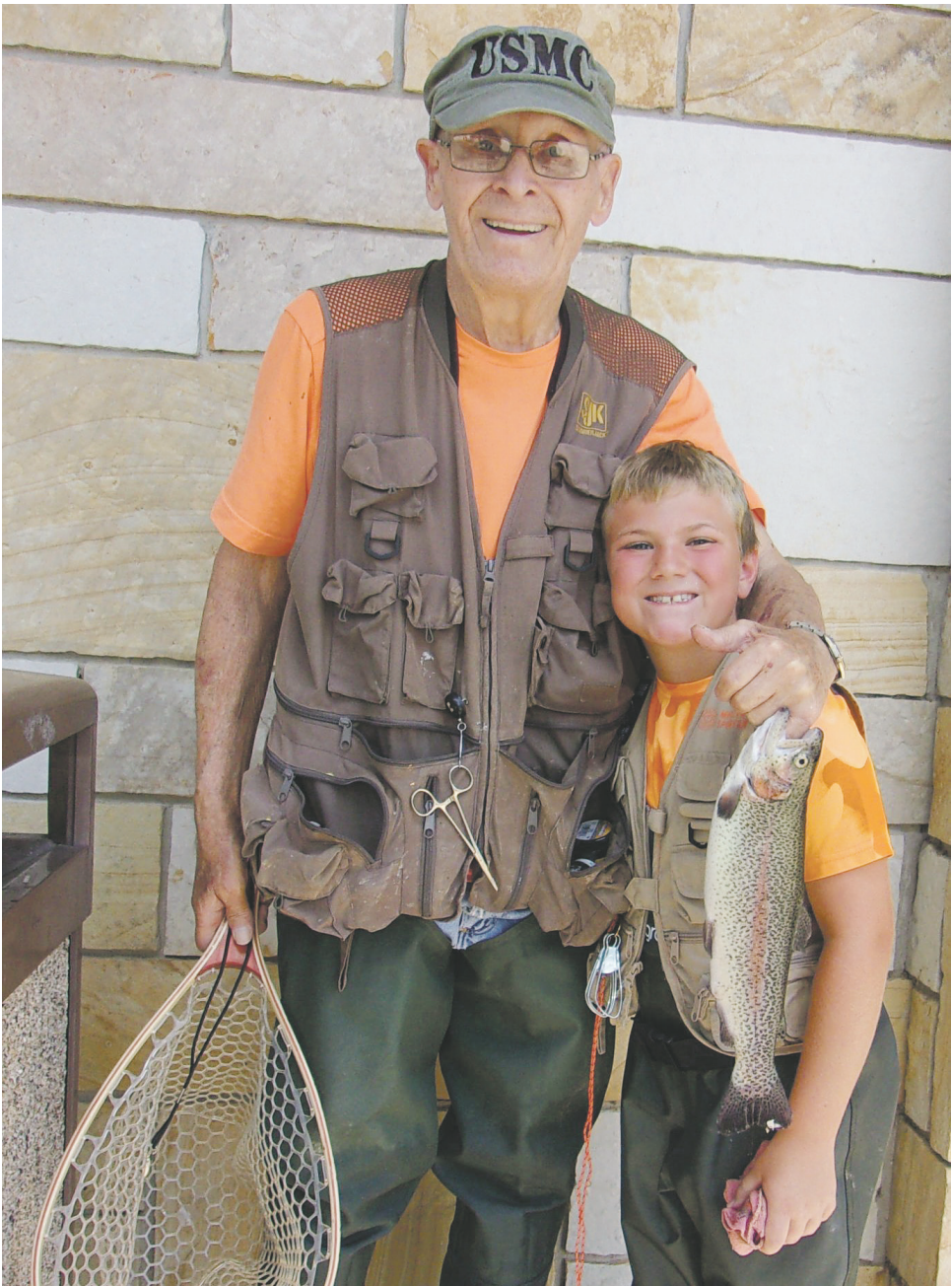
Generations shared their love for the sport at Bennett Spring State Park this summer.