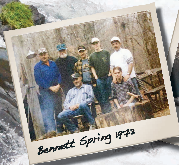
Bennett Spring 1973