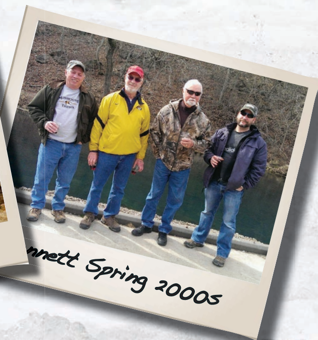
Bennett Spring 2005